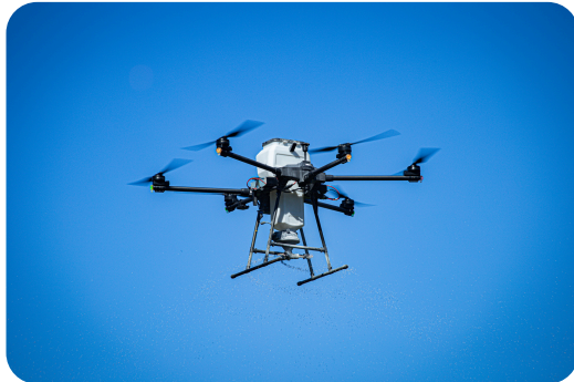
LEFT: Drone in action spreading a cover crop mix of crimson clover and daikon radish.