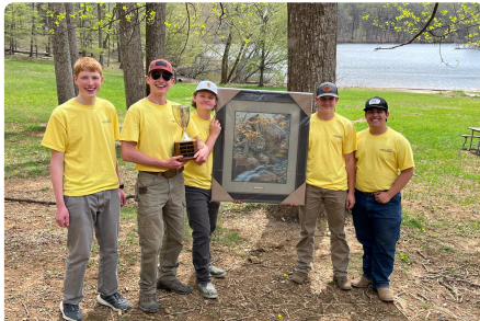
1st Place: "Whopper Ploppers" Catoclin HS

The Frederick County Envirothon was held on April 22 nd at Cunningham Falls State Park in Thurmont. Twenty-four teams competed this year to test their knowledge in aquatics, forestry, soils, wildlife, and a fifth issue that changes each year. This year's fifth issue was "Roots and Resiliency: Fostering Forest Stewardship in a Canopy of Change". Help us in congratulating the following winners: