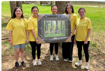
2nd Place: "Picasso Moths" Urbana HS