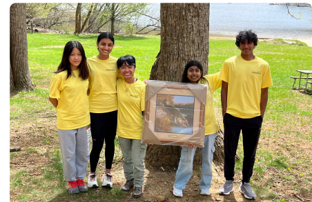
3rd Place: "Cryptic Copperheads" Urbana HS